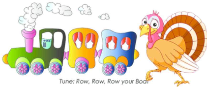
Tune: Row, Row, Row your Boat